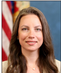
Hon. Jacquelyn Suarez Commissioner, NJDCA