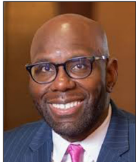
Hon. Troy Singleton NJ State Senator